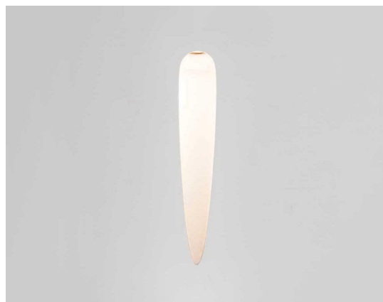
CODE: 1343002 (7512) FINISH: TEXTURED WHITE

TO MAINTAIN THIS PRODUCT TO ITS BEST CONDITION, PLEASE VIEW OUR CARE AND CLEANING GUIDE ON THE SUPPORT SECTION OF THE ASTRO WEBSITE.