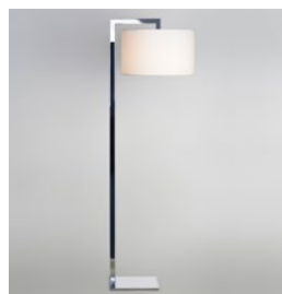
CODE: 1222001 FINISH: POLISHED CHROME