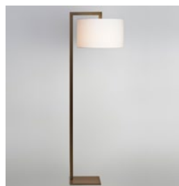
CODE: 1222003 FINISH: BRONZE

TO MAINTAIN THIS PRODUCT TO ITS BEST CONDITION, PLEASE VIEW OUR CARE AND CLEANING GUIDE ON THE SUPPORT SECTION OF THE ASTRO WEBSITE.