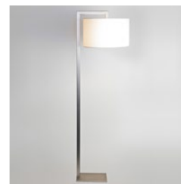
CODE: 1222002 FINISH: MATT NICKEL